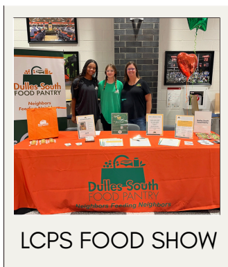
LCPS FOOD SHOW