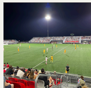
LOUDOUN UNITED SOCCER EVENT