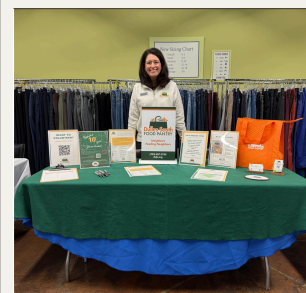
WOMEN GIVING BACK